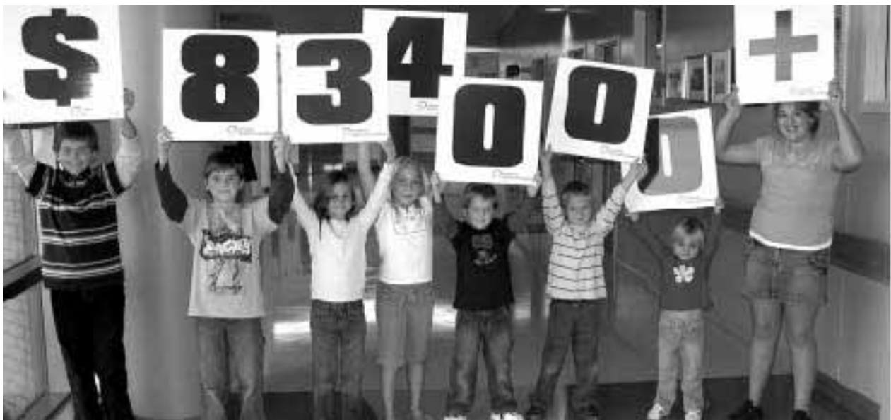
Pictured above the Bowen, Chevarie and Cheverie children in late September displaying the funds raised to date in support of the Growing Care campaign. These children represent our future and highlight the need for us to continue “growing care” at the Cumberland Regional Health Care Centre.

Be sure to visit the campaign website at www.chcfoundation.com/growing for further information, or visit the foundation office located inside the main entrance of the Cumberland Regional Health Care Centre.