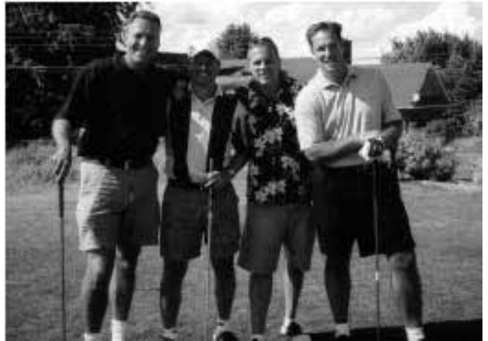
Roche - Winners in a tie at the 11th Highland Classic