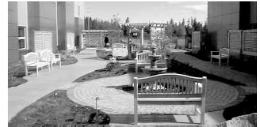
Holly Spicer Garden